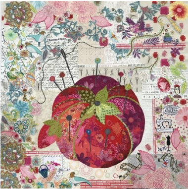
Laura Heine collages

Next April, Laura Heine will visit our guild with her amazing collage quilts! Following the Thursday, April 4 lecture as the monthly program, we will offer a series of workshops on April 5, 6 and 7. Patterns have not been determined yet, as she is releasing some new patterns soon that we may wish to offer as class projects. Stay tuned!